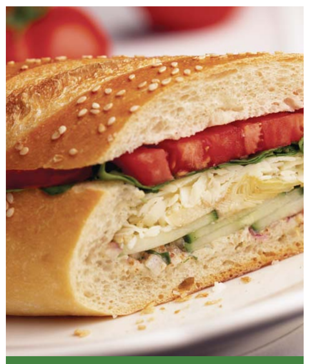
Tomatoes are the #1 vegetable associated with sandwiches on the menu.

Source: Food Beat™ Inc., for Produce for Better Health