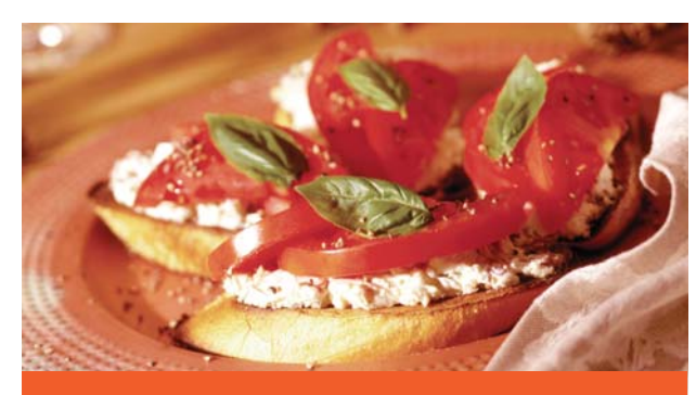
US restaurants have experienced a 9% increase in sandwich orders over the last 14 years.